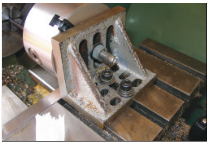
Photo 6. The chuck is bolted to the angle plate by a bolt through the centre.

The finished chuck and backplate can be seen in photo 11 . You can clearly see the oversize flange that I have left to drill for the simple dividing attachment. You could of course turn the backplate down to the diameter of the chuck if you wish but even if you don't want to drill for the dividing holes, the extra flange will be very useful for clamping the chuck down on the mill.