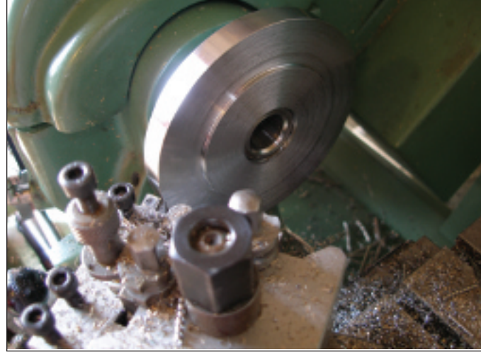
Photo 2. Chamfering the backplate after turning the chuck register.

Put the chuck onto the backplate and clamp an angle plate square onto the cross slide using the chuck as a parallel spacer, photo 3 . Clamp the chuck to the angle plate, photo 4 ensuring that one of the three mounting holes is in line with a drill shank in the lathe headstock, photo 5 . A drill chuck in the mandrel will be